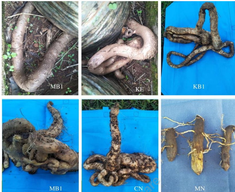
Plate 2: Extracted root tubers of net-house grown yam accessions, MB1 and KB1 (Baringo), KEa and TE (Elgeyo-Marakwet), CNa (Nandi) and MN (Nyeri)