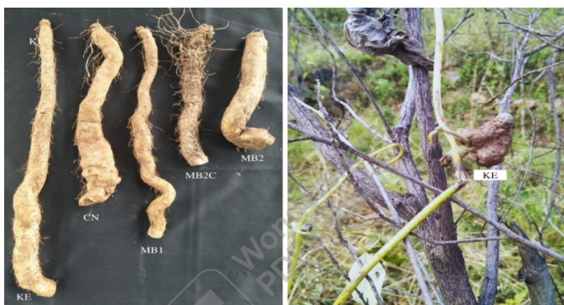
Plate 4: Harvested Tubers of the Field Grown D. schimperiana Accessions (KE, CN, MB1, MB2), control (MB2C), and D. schimperiana Bulbils Produced by Accession KE in the Field

Values with the same letter(s) in a column are not significantly different at P \leq 0.05 , according to Tukey's test.