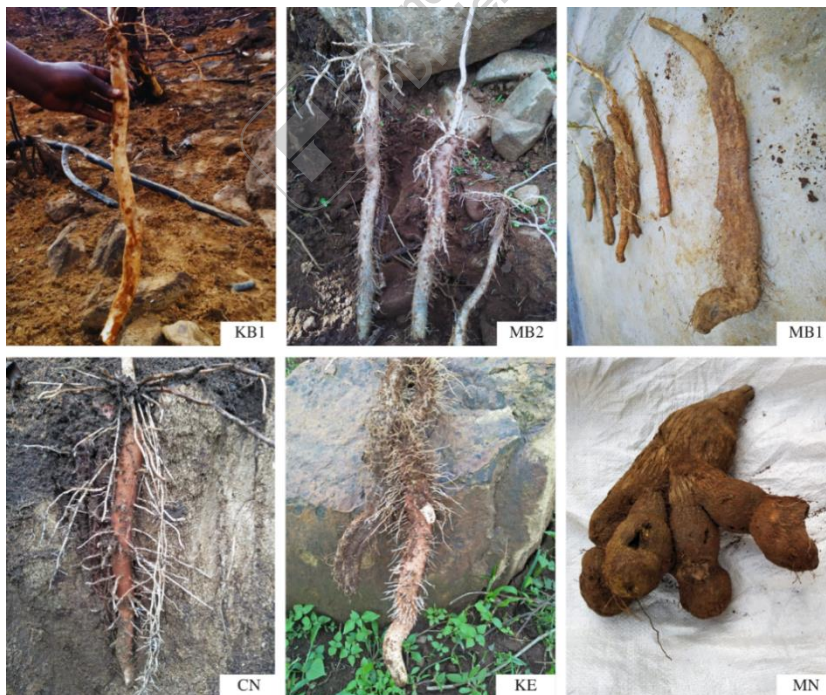
Plate 3: Wild Yam, Dioscorea schimperiana Kunth (KE1, CN, MB2, KB1 and MB1) and D. alata (MN) Underground Tubers Collected in situ